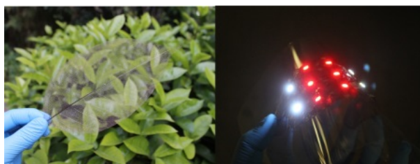
Fig. 2. VTEs made on natural veins.